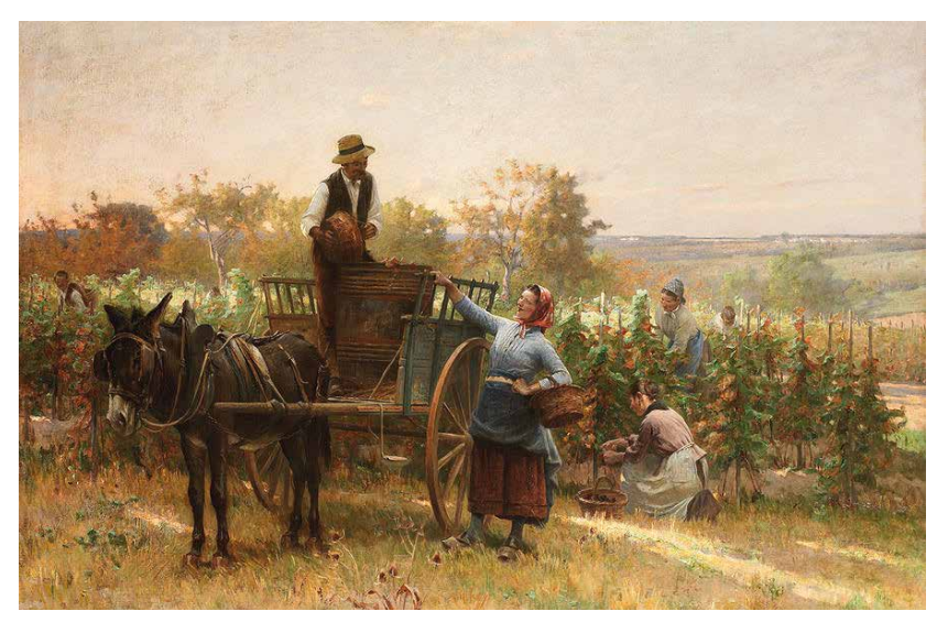
"The grape harvest painting" Adrien Moreau

Join us and learn the entire process, from harvesting the grapes while still on the vines, to their transformation in the winery.